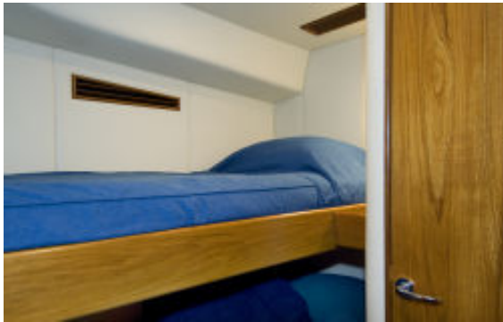
Double crew bunks