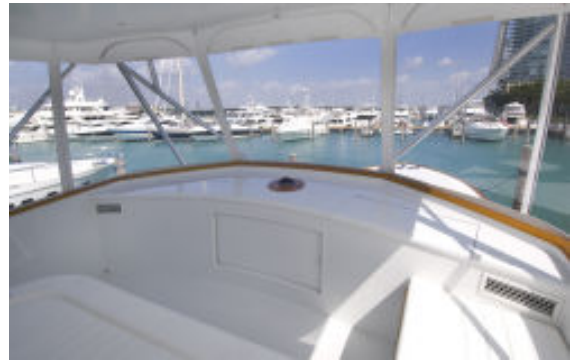
FWD Bridge seating